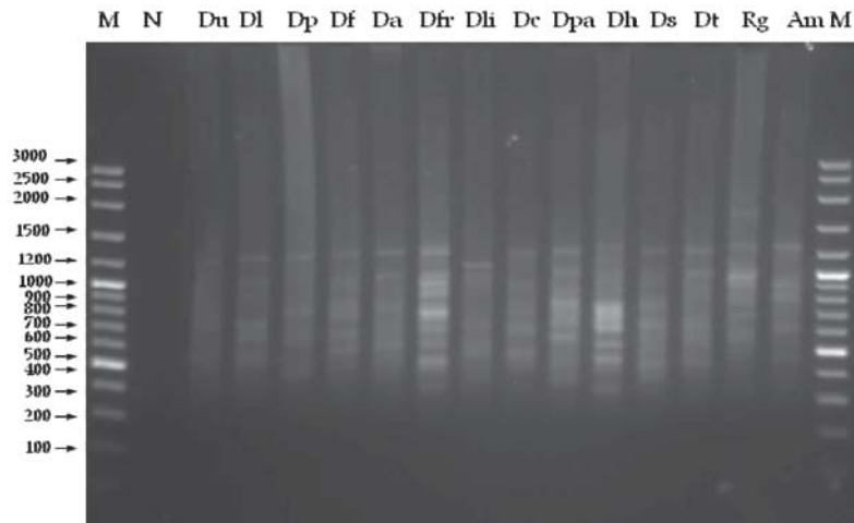
Figure 1. Agarose gel photographs of the PCR products amplified by ISSR PP3 primer.